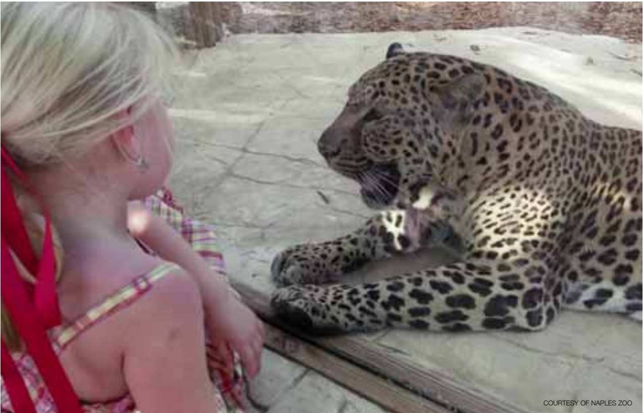
"Best Place to take the Kids" by Gulfshore Magazine - NAPLES ZOO

1 Panama City...Designed for Florida's younger visitors, the Junior Museum of Bay County , encourages your child to learn and explore in a world made just their size. Created in 1967, the 12-acre site features indoor science and adventure exhibits in addition to their outdoor nature walk and pioneer homestead with replicated buildings from the 1800s. Exhibits include Reptiles, Fishing in St. Andrews Bay and Toddler Town. 850-769-6128 | www.jrmuseum.org