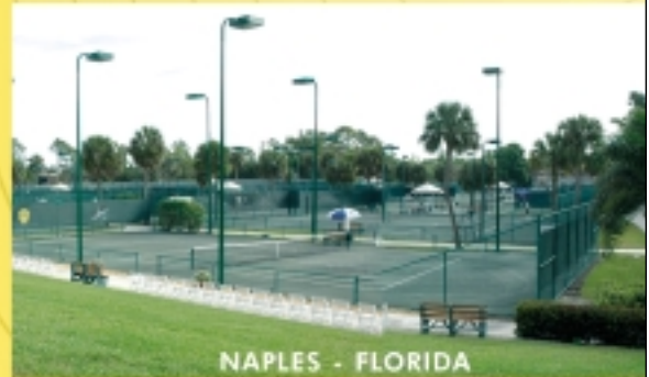
NAPLES - FLORIDA

THE "SECRETS OF MOVEMENT" ARE TAUGHT IDENTICALLY IN BARCELONA, SPAIN AND NAPLES, FLORIDA