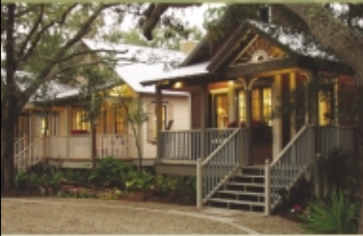
Voted Florida's Most Enchanting and Romantic Hidden Retreat

A Day You'll Always Remember, A Place You'll Never Forget