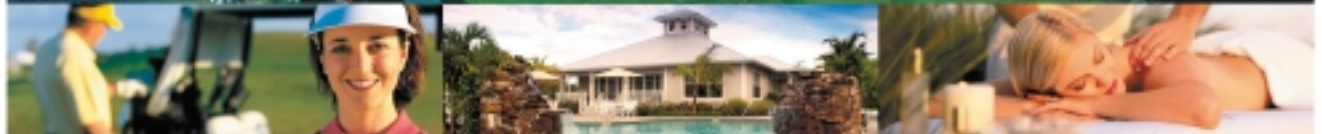
GreenLinks Golf Resort & Conference Center

This is a rare chance to pursue your passion for the game of golf on Naples' only Robert Trent Jones, Sr. signature course. Or Lee Trevino's extraordinary Mustang course. In all, it's 36 holes of golf that continually receives four-star ratings from such experts as Golf Digest, Golfweek and LINKS magazines. We also feature 200 condominium suites including one, two and three bedrooms. You can... Escape... Relax... Restore... Emerge... Guest of GreenLinks Golf Resort also have access to the Players Club Spa, a facility on par with the best Naples has to offer. Contact us today. Pursue your passion!