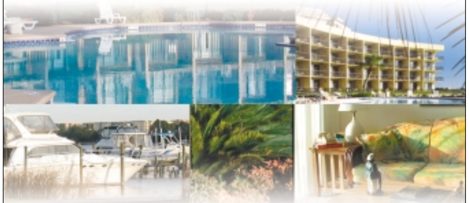
Mini-Suites overlooking the marina. Fully-equipped kitchenettes. Available on a nightly rental. Walking distance to area's most popular restaurants and lounges.