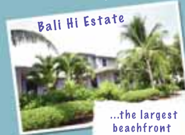
Bali Hi Estate

...the largest beachfront rental on Captiva Island