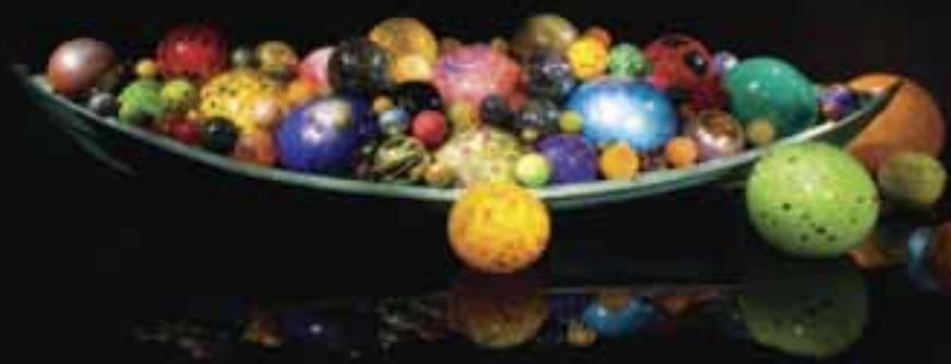
Float Boat

Tickets for the Chihuly Collection and the Morean Glass Studio & Hot Shop are available on line at ChihulyCollectionStPete.com